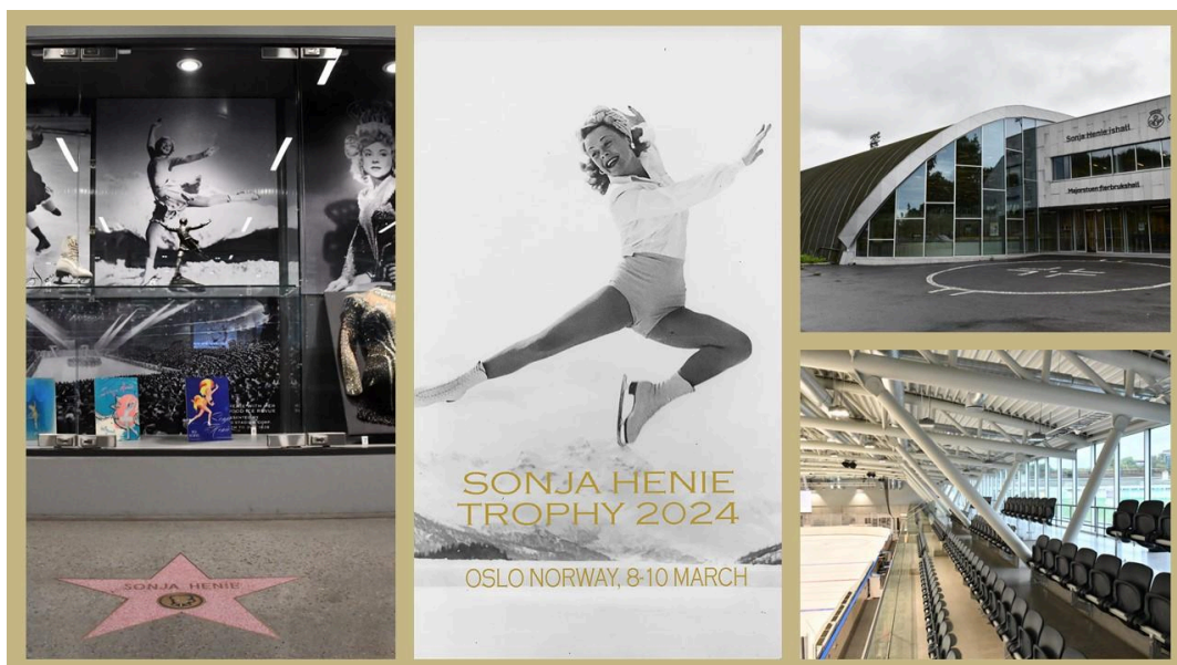
Sonja Henie Ice Rink

Come to Oslo and experience our modern and bright skating rink from 2020 named after the legendary Norwegian figure skater Sonja Henie. Abundant use of glass secures a lot of natural light and creates a stylish atmosphere. During winter there is also an outdoor rink. In the cafeteria you can both see the rink through big windows, and also a small Sonja Henie exhibition.