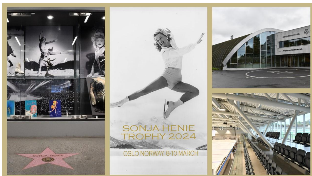
Sonja Henie Ice Rink

Come to Oslo and experience our modern and bright skating rink from 2020 named after the legendary Norwegian figure skater Sonja Henie. Abundant use of glass secures a lot of natural light and creates a stylish atmosphere. During winter there is also an outdoor rink. In the cafeteria you can both see the rink through big windows, and also a small Sonja Henie exhibition.