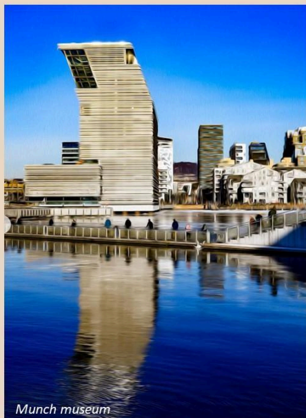
Up Munch museum

In summary, Oslo is a captivating destination that seamlessly blends history, nature, and modernity. Its rich cultural offerings, stunning natural landscapes, and commitment to sustainability make it a must-visit city for any traveler looking to experience the best of Norway.