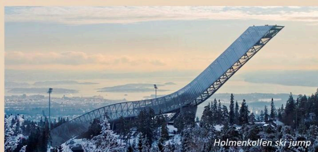
Holmenkollen ski jump