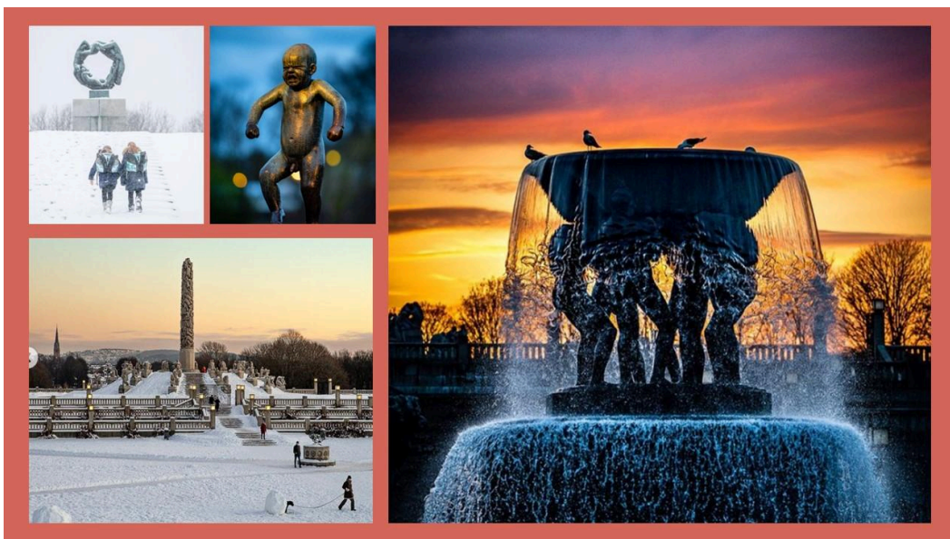
Vigeland Sculpture Park

Nature enthusiasts will be captivated by the numerous parks and green spaces scattered throughout the city. Vigeland Park, adorned with over 200 striking sculptures by Gustav Vigeland, is a testament to human emotion and connection.