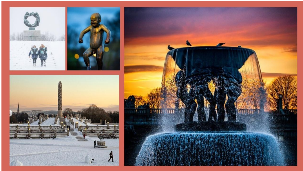
Vigeland Sculpture Park

The Oslo Opera House, with its unique architecture and panoramic views from the roof, is another must-see attraction.