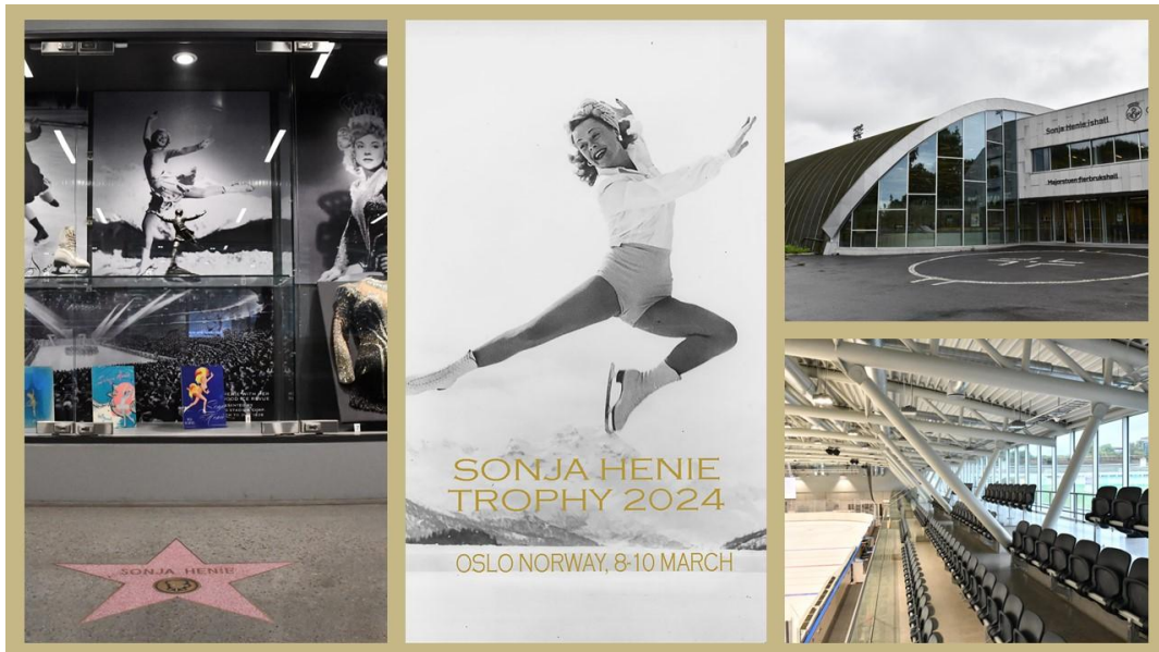
Sonja Henie Ice Rink

Come to Oslo and experience our modern and bright skating rink from 2020 named after the legendary Norwegian figure skater Sonja Henie. Abundant use of glass secures a lot of natural light and creates a stylish atmosphere. During winter there is also an outdoor rink. In the cafeteria you can both see the rink through big windows, and also a small Sonja Henie exhibition.